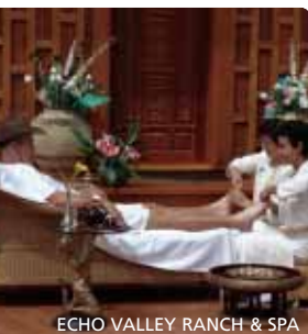
ECHO VALLEY RANCH & SPA

An alpine wilderness retreat Echo Valley Ranch & Spa is surrounded by boreal forests, lakes and canyons. Here Western hospitality is juxtaposed with Asian pampering on 160