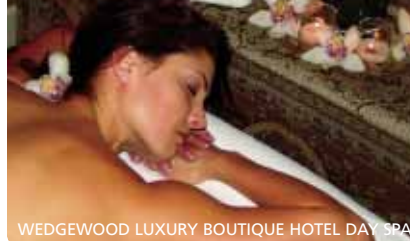
WEDGEWOOD LUXURY BOUTIQUE HOTEL DAY SPA

Located on the outskirts of the desert resort town of Kamloops, BC. The deluxe, 22,000 square foot Sunmore Ginseng Day Spa houses a unique spa and elegant tearoom. Treatments and cuisine revolve around locally grown ginseng – the King of Herbs used for more than 5,000 years in Asia to promote physical stamina. Enjoy the soothing and healing properties of an aromatherapy massage with plant and herb essential oils. The mandate is to balance body, mind and spirit to promote harmony from within using the elements of Yin Yang: gold, wood, water, fire, earth. Bliss!