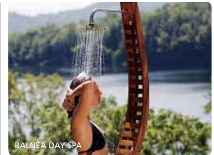
BALNEA DAY SPA

Menthe Fraicheur's owner grows and processes the mint used in this restored 1904 Grand Truck railway station day spa in the quaint village of Coaticook. Be swathed in soothing creams and lotions while legs,