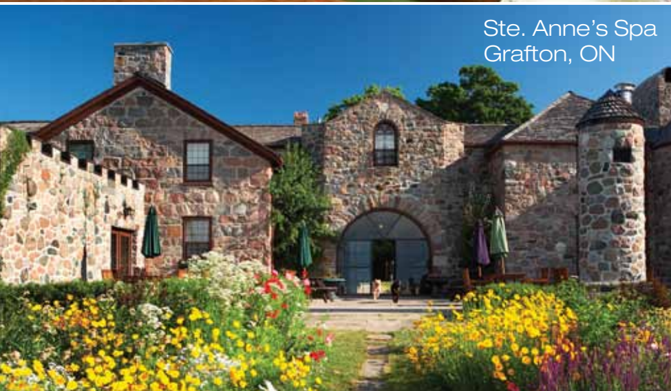
Ste. Anne's Spa Grafton, ON