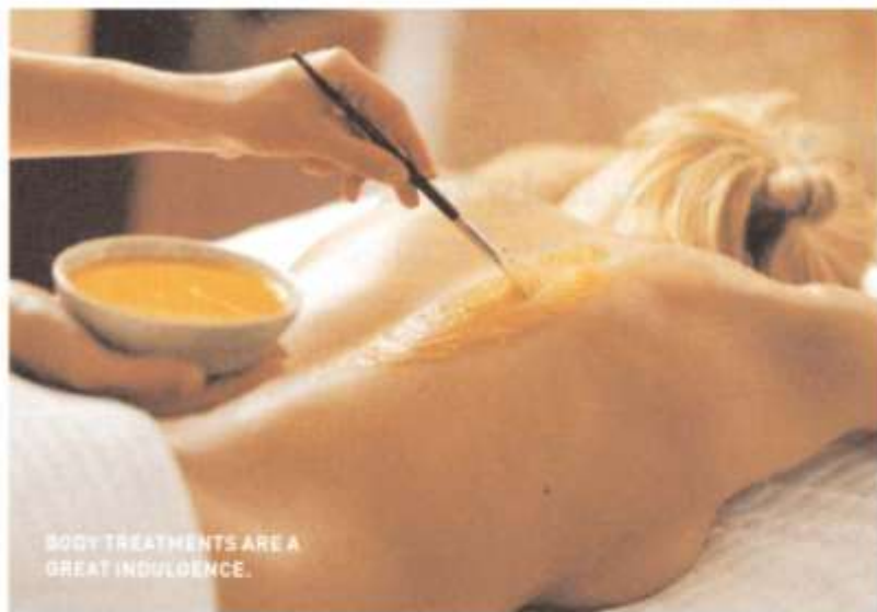
BODY TREATMENTS ARE A GREAT INDULGENCE.