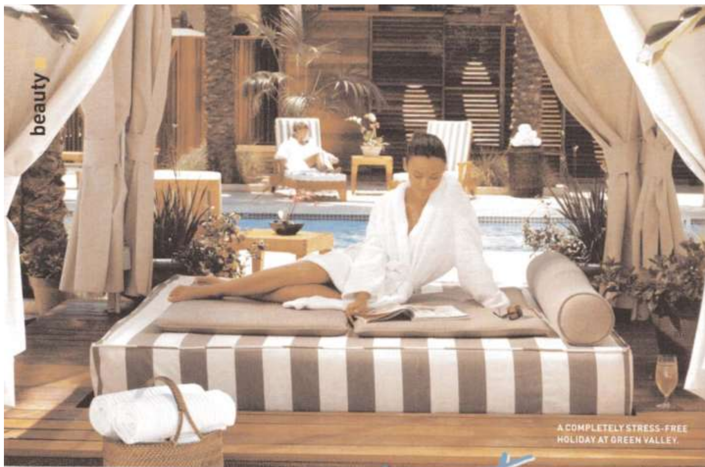
A COMPLETELY STRESS-FREE HOLIDAY AT GREEN VALLEY.