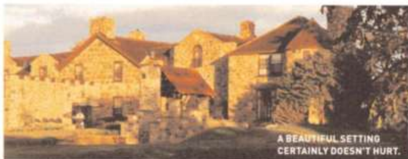
A BEAUTIFUL SETTING CERTAINLY DOESN'T HURT.

Corcoran says, ideally, a guest should have at least one treatment a day. 🧡