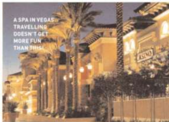
A SPA IN VEGAS TRAVELLING DOESN'T GET MORE FUN THAN THIS!